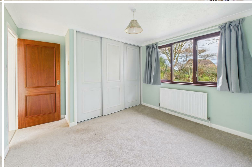
Gwithian Road, Connor Downs, Hayle, TR27 5EA